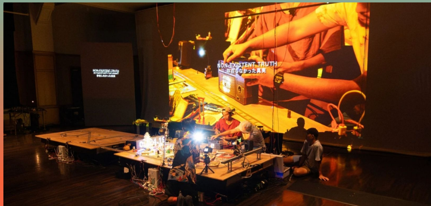
Juggle & Hide by Wichaya Artamat ( https://www.bipam.org/bipam2025 )

Rub elbows with fellow creatives at BIPAM's exclusive networking sessions. Share ideas, spark collaborations, and create lasting connections in Bangkok's thriving artistic hub. It's all about exchanging creative energy and forging your next big opportunity!