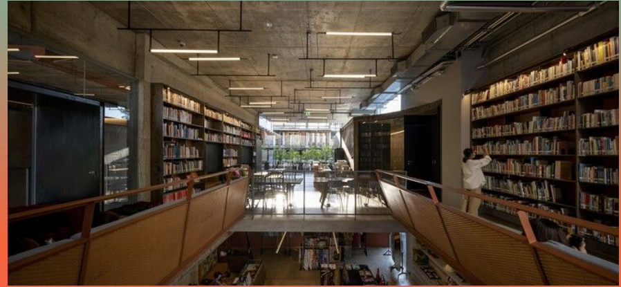
Jim Thompson Art Center

Step into Bangkok's buzzing art scene with expert-led tours of hidden gems like Artist+Run, Jim Thompson Art Center, Galileoasis, and CREAM Bangkok. You'll also roam the streets of Yaowarat, discovering the city's creative soul, from ancient alleyways to cutting-edge exhibitions.