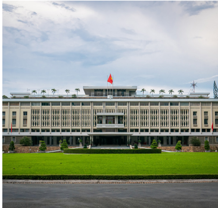
Independence Palace (Dinh Độc Lập), also known as Reunification Palace

Spotlight Singapore celebrates the important landmark of 50 years of diplomatic relations and 10 years of strategic partnership between the Socialist Republic of Vietnam and the Republic of Singapore. Both countries enjoy strong ties in trade and investments, with the 13 Vietnam-Singapore Industrial Parks standing as testament to bilateral partnerships.