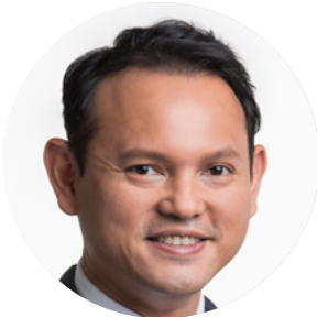
Mr Zaqy Mohamad Senior Minister of State, Ministry of Defence and Ministry of Manpower