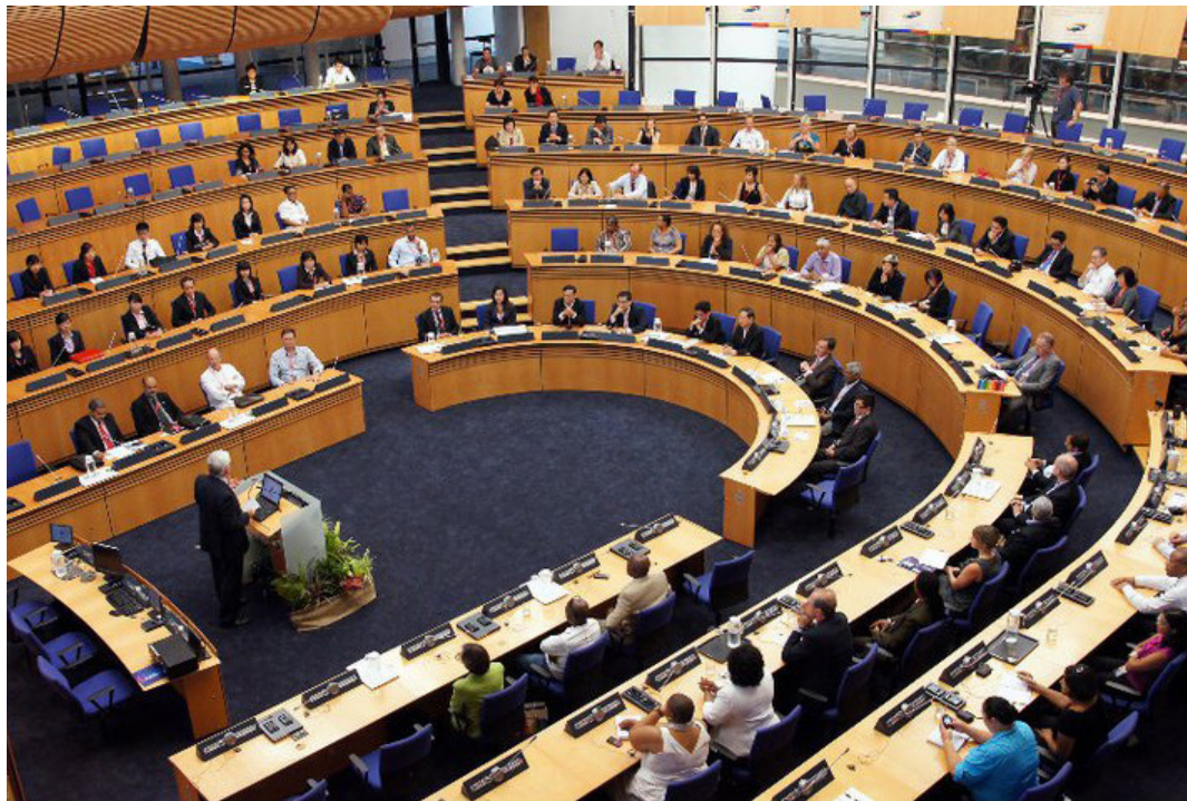
Cape Town (2011)

Launched in 2006, Spotlight Singapore has since taken place eight times in major cities: Hong Kong (2006), Tokyo (2006), Moscow (2008), Cape Town (2011), Bratislava and Prague (2012), Mexico City (2015) and Delhi (2019).