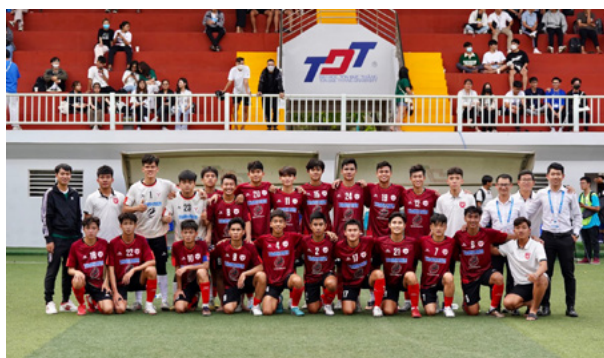
Teams Vietnam Men