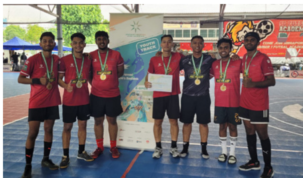
Teams Singapore Men