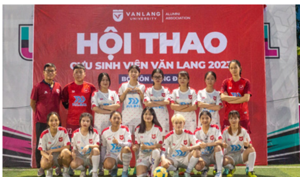
Teams Vietnam Women

The boy’s and girl’s teams representing Singapore are selected from a Futsal Qualifying Tournament held in August 2023. Their Vietnam counterparts are leading youth Futsal teams from Vietnam universities.