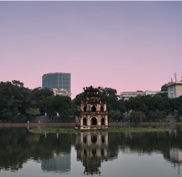
Hoàn Kiếm Lake at dusk

50 years of diplomatic relations 10 years of strategic partnership