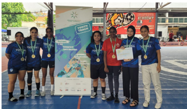
Teams Singapore Women